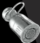
1.25 GPM Kitchen Aerator