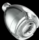
1.0/1.25 GPM Earth™ Showerhead