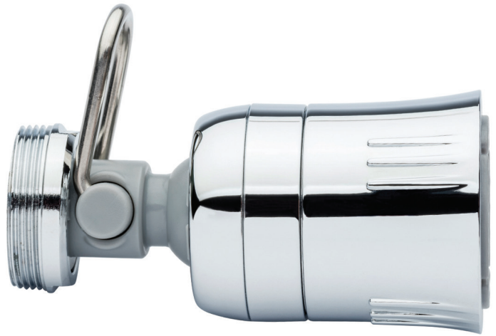
WITH PAUSE VALVE