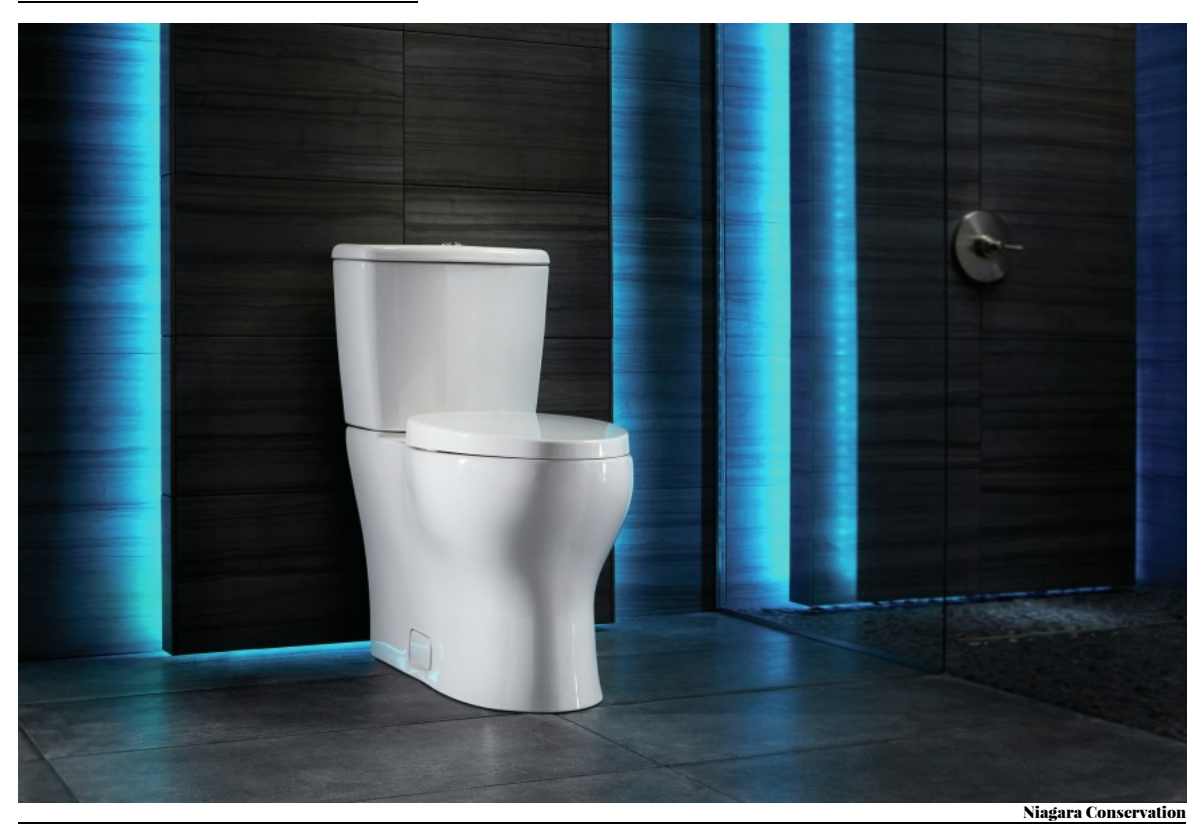
Niagara Stealth Phantom Toilet