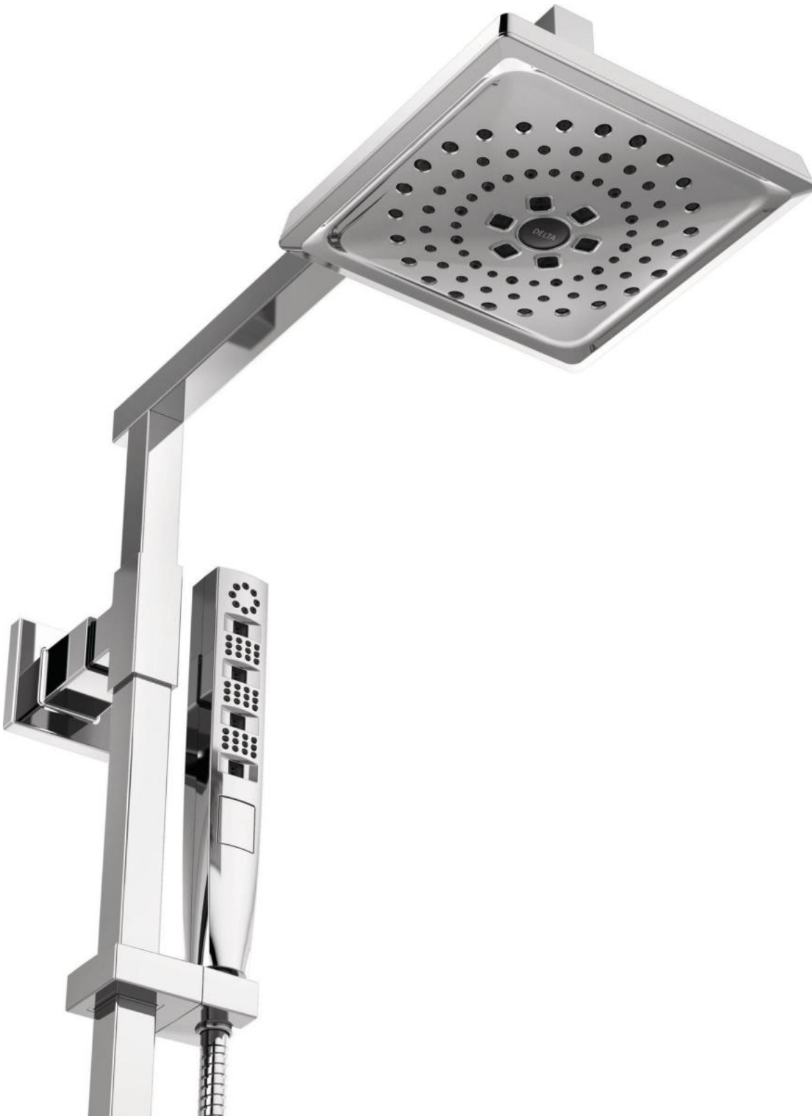
Delta Faucet Co.