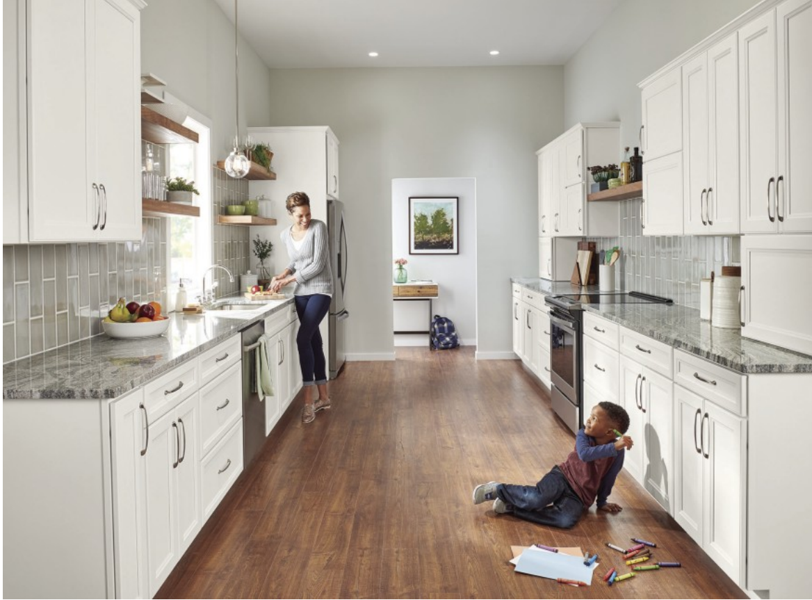
Wolf Home Products

Samsung recently redesigned its 30-inch built-in, flush-mounted wall ovens, in single or double configurations. The ovens feature a removable Flex Duo smart divider that splits the oven cavity into cooking sections to create independent ovens that can be set at different temperatures. The ovens also have a one-touch steam cook tray for optimal cooking and convection settings. Two finishes are available: stainless steel or matte black stainless steel.