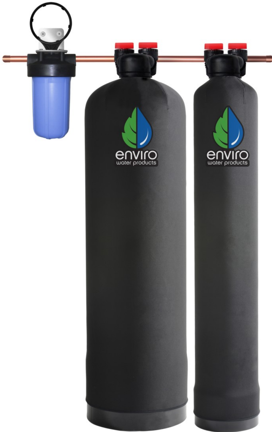
Enviro Water Products