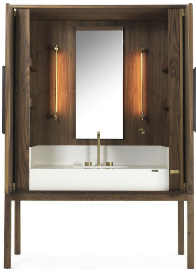
Silestone by Cosentino