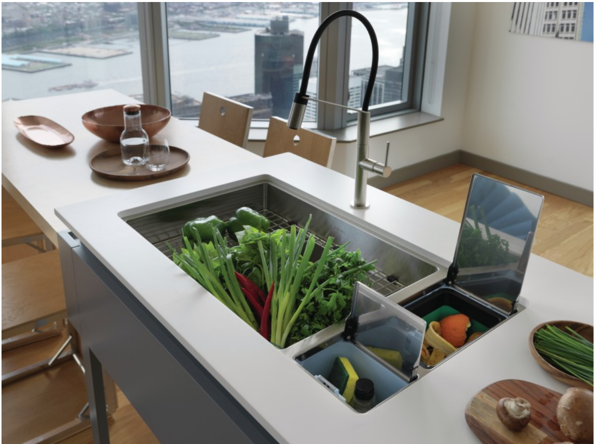
Franke Kitchen Systems

The Chef Center transforms the traditional kitchen sink into a hub for food preparation. The large 18-gauge stainless steel sink comes in three sizes for 33-, 36-, and 45-inch cabinets, and comes with customizable compartments so homeowners can personalize their workspace. The Chef Center features two removable, antimicrobial compartments that can be used as a compost bin, storage bin, wine bucket, and more, and comes with a variety of accessories including a cutting board, colander, sink grid, drainer board, and a dishwasher-safe Roller Mat for drying and draining dishes.