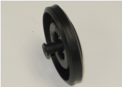
Rubber Seal Disc for Fluidmaster Fill Valve Niagara Part #: C2216-9RS

Works with Niagara EcoLogic/Flapperless Models: Sentinel N2216, N2235, N2225 and Glacier Bay's 779-923 and 840-565