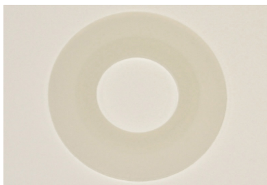
Silicone Seal for Single Flush Valve - A2702 R&T Model Niagara Part #: N7715SS

Works with Niagara Stealth Models: The Original N7714T-DF and N7714-HH, One Piece N7711, Phantom N7747, and Nano N7747T-DF Helpful IDs on Part: 1#-07