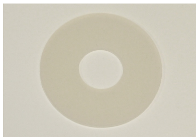
Silicone Seal for Dual Flush Valve Niagara Part #: C7700DF-SS

Works with Niagara Fluidmaster Fill Valve: 400A and 703A