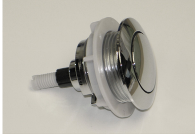
Single Flush Button for Stealth Toilet Line Niagara Part #: C7715-6.4

Works with Niagara Stealth Models: The Original N7714 and N7714-HH, One-Piece N7711, and Phantom N7747T Helpful IDs on Part: 2#-04